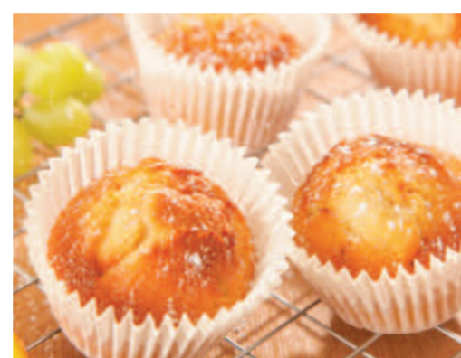
Apple & Cinnamon Muffin