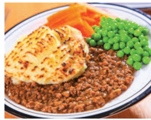
Cottage Pie served with Seasonal Vegetables