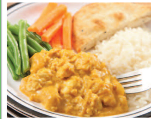
Chicken Korma served with Rice, Naan Bread & Seasonal Vegetables