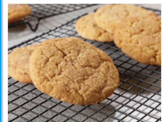
Snicker Doodle Biscuit

AVAILABLE EVERY DAY – UNLIMITED SALAD, FRESHLY BAKED BREAD, FRUIT YOGHURT & FRESH FRUIT PLATTER. FOR ALLERGEN INFORMATION, PLEASE ASK ONE OF OUR CATERING TEAM. ALL THE ABOVE DISHES ARE SUBJECT TO AVAILABILITY.