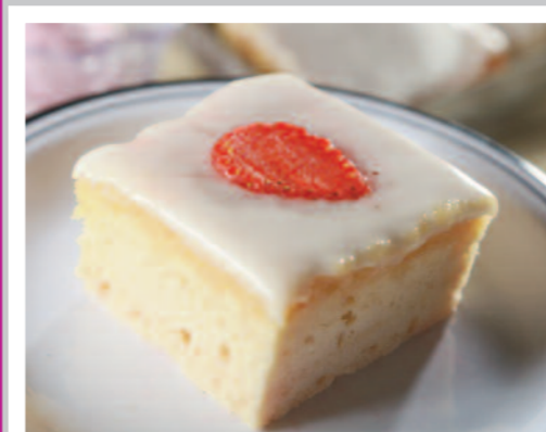
Strawberry Ice Cream Cake