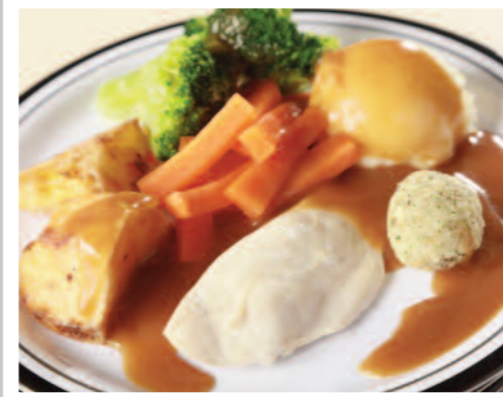
Roast Chicken served with Roast/Mashed Potatoes, Seasonal Vegetables & Gravy