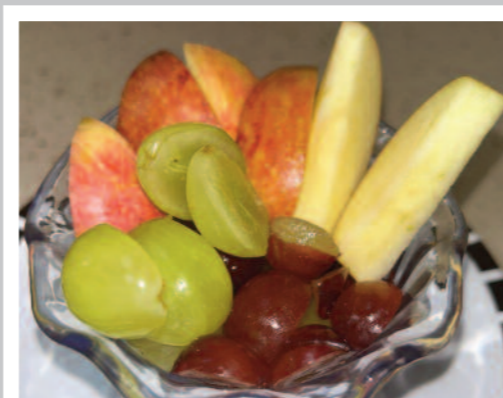
Apple & Grape Pot