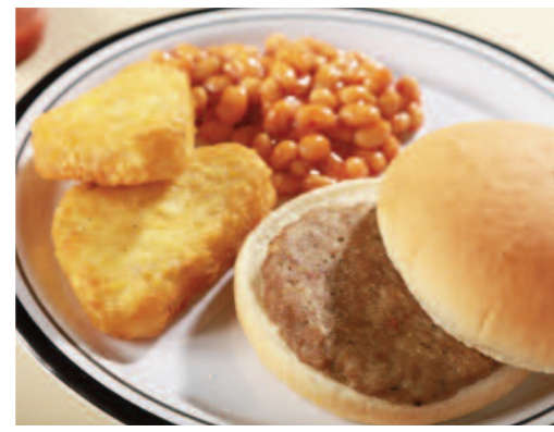
Sausage Pattie in a Bun, Hash Browns and Baked Beans