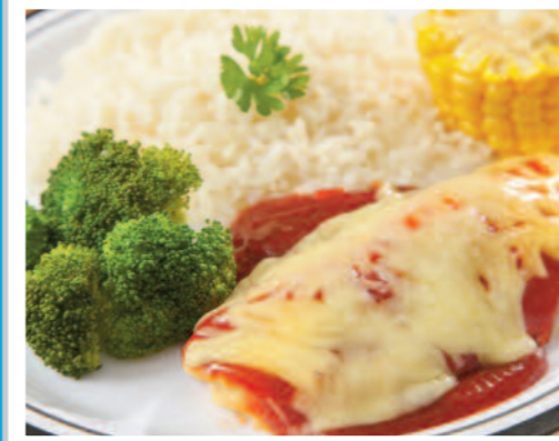
BBQ Chicken served with Savoury Rice and Seasonal Vegetables