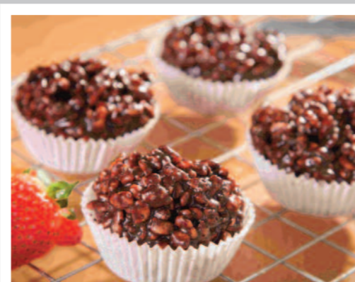
Chocolate Crispy Cake