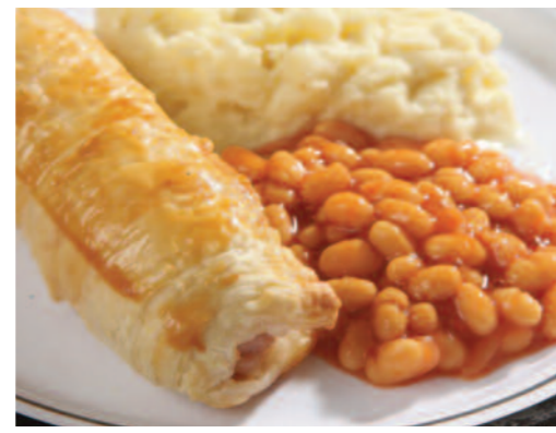
Homemade Sausage Roll served with Mashed Potato & Baked Beans