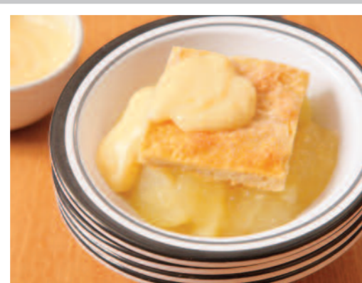
Apple Pie & Custard