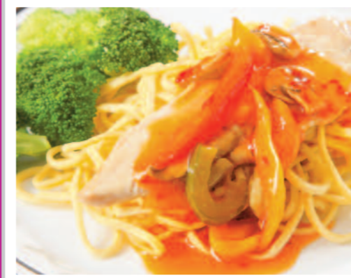
Sweet Chilli Chicken served with Noodles & Seasonal Vegetables