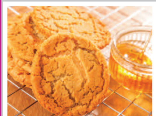
Golden Crunch Cookie

AVAILABLE EVERY DAY – UNLIMITED SALAD, FRESHLY BAKED BREAD, FRUIT YOGHURT & FRESH FRUIT PLATTER. FOR ALLERGEN INFORMATION, PLEASE ASK ONE OF OUR CATERING TEAM. ALL THE ABOVE DISHES ARE SUBJECT TO AVAILABILITY.