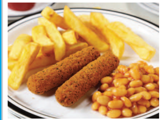
Breaded Mozzarella Sticks served with Chips & Peas or Baked Beans