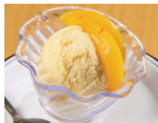
Ice Cream & Fruit