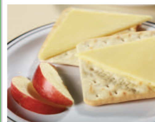
Cheese & Crackers