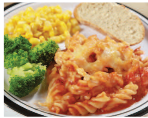
Cheese & Tomato Pasta served with Garlic & Herb Bread and Seasonal Vegetables