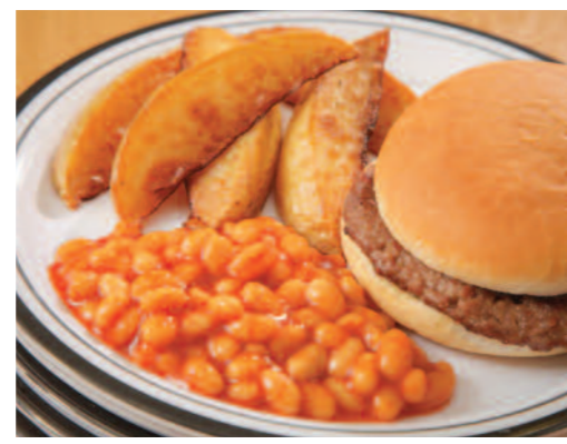
Beef Burger served in a Bun with Potato Wedges & Seasonal Vegetables or Baked Beans