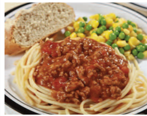
Spaghetti Bolognese served with Garlic & Herb Bread and Seasonal Vegetables