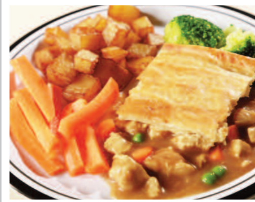
Homemade Chicken Pie served with Diced Crispy Potatoes & Seasonal Vegetables