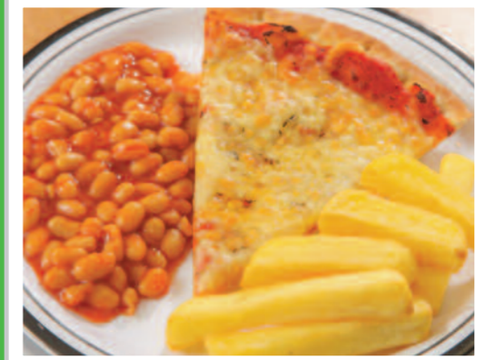
Cheese & Tomato Pizza served with Chips & Peas or Baked Beans